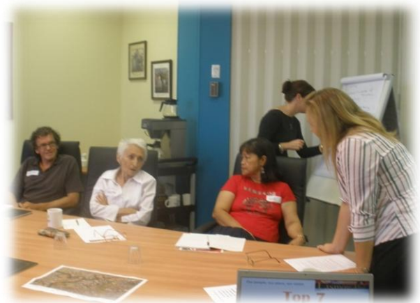
Participants in Action (Mature Age Go Getters)