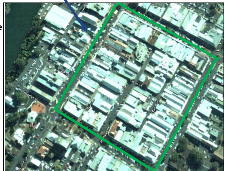
The CBD Block – Molesworth, Woodlark, Keen and Magellan Streets

Where time permitted, focus groups were asked to list places in the City Centre that already attract high numbers of people to the City Centre, the above map has collated this information.