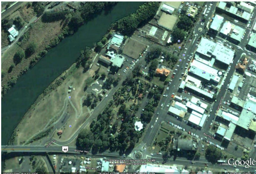
Wilsons River and Riverbank parks

“Parking management – longer term parking, 2 hours not enough time.”