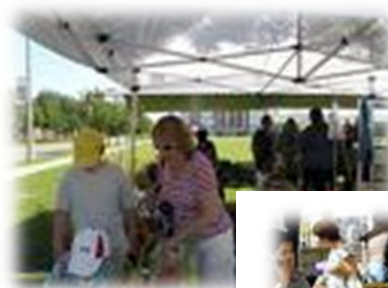
100 Mile Market