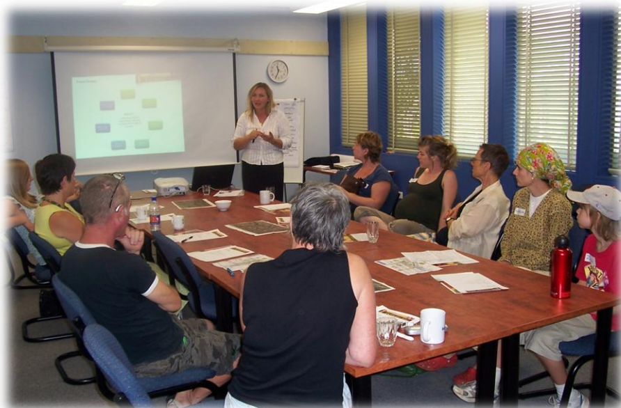
A community of ideas

A total of 56 people participated in the focus group meetings. A number of other people, who were unable to make the meetings, provided input via email, this information was included with the appropriate focus group. Participants were invited to provide their contact details for further communication and updates on the project. A short survey was also conducted to provide feedback on the focus group process including areas such as venue, facilitation and provision of information. Positive feedback about the consultation process was received.